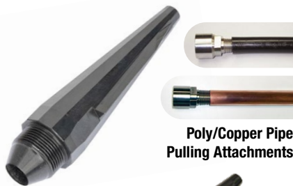
Poly/Copper Pipe Pulling Attachments