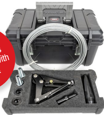
Cable sold separately

Pulling attachments INCLUDED with each Kit!