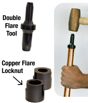
Double Flare Tool