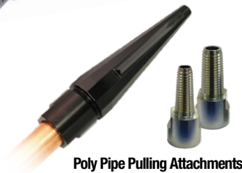
Poly Pipe Pulling Attachments