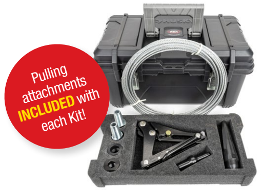
Cable sold separately